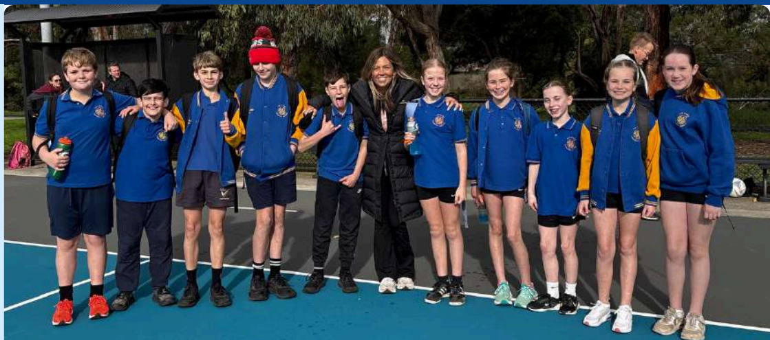
2025 - Mixed Netball Team @ Division Finals